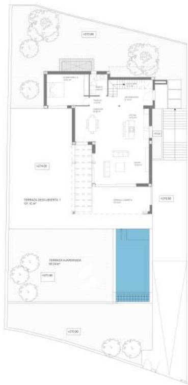
PLOT: 720,86 M2