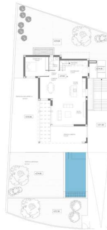
PLOT: 660,19 M2